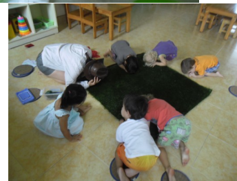
When all the cows are sleeping and the sun has gone to bed!