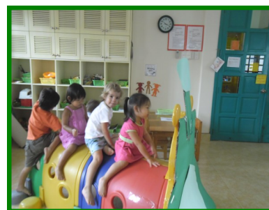
All Aboard the Green Group Train! Choo Choo!"

We made lots of big transport models that we could actually play in. This helped us to learn about team work and gave us a great chance to role-play really being a pilot, a bus driver, a train driver or a passenger. The children in Green Group loved sitting in/on the models and singing songs about Planes, Trains, Buses and Cars!